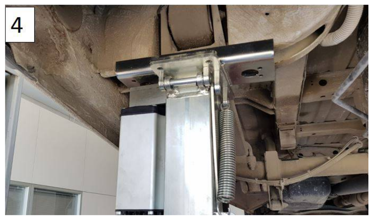
Fix the jack.

USE THE SAME PROCEDURE FOR THE REAR RIGHT ADAPTER