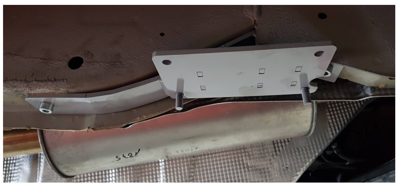
Follow the same procedure of the front left adapter