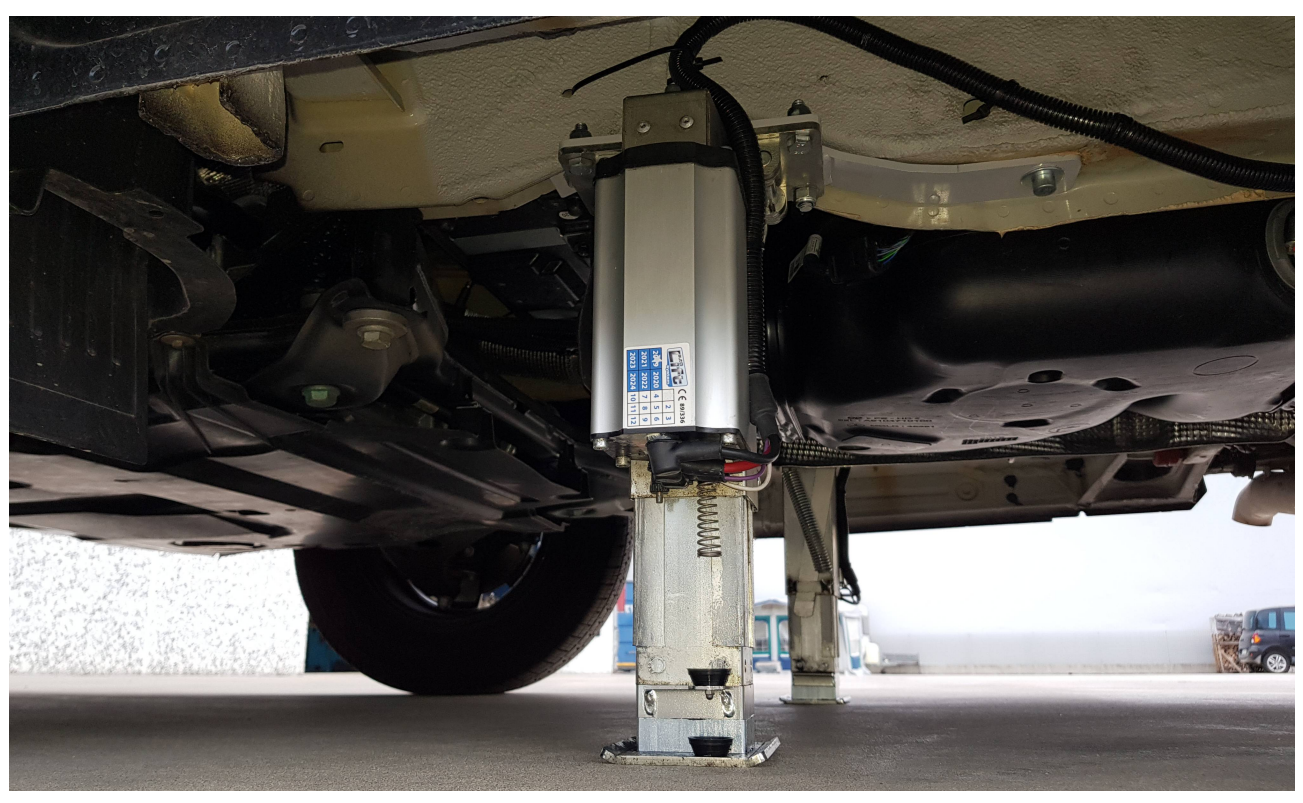
EXAMPLES OF JACKS CORRECTLY INSTALLED