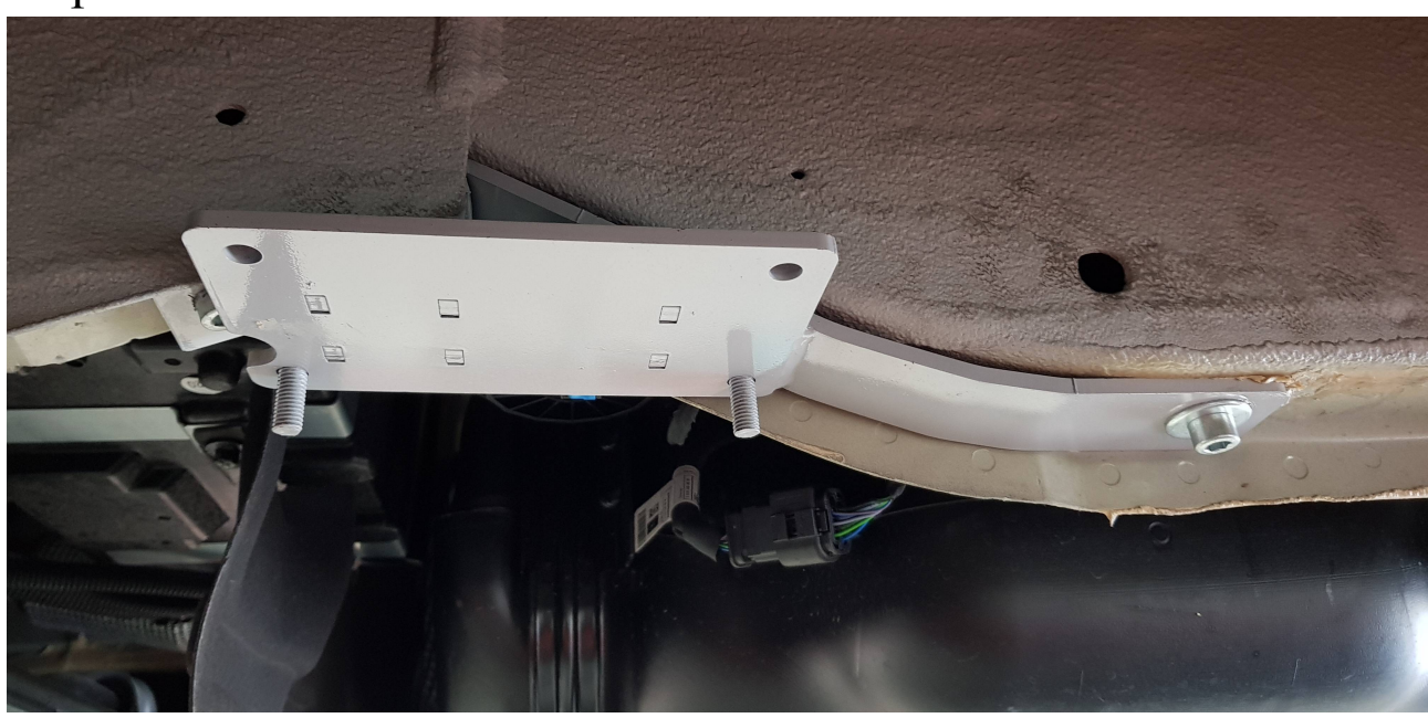
Fit the adapter with the bolts supplied