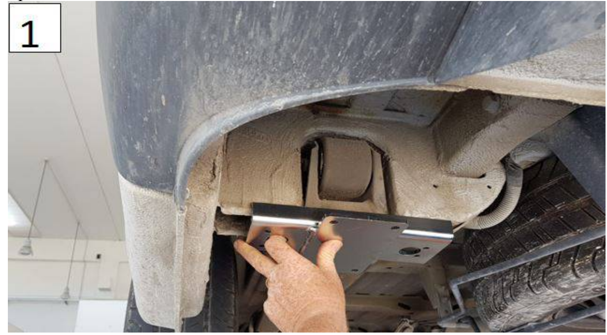
Put the adapter in the point illustrated, the rear support of the crossbow suspension