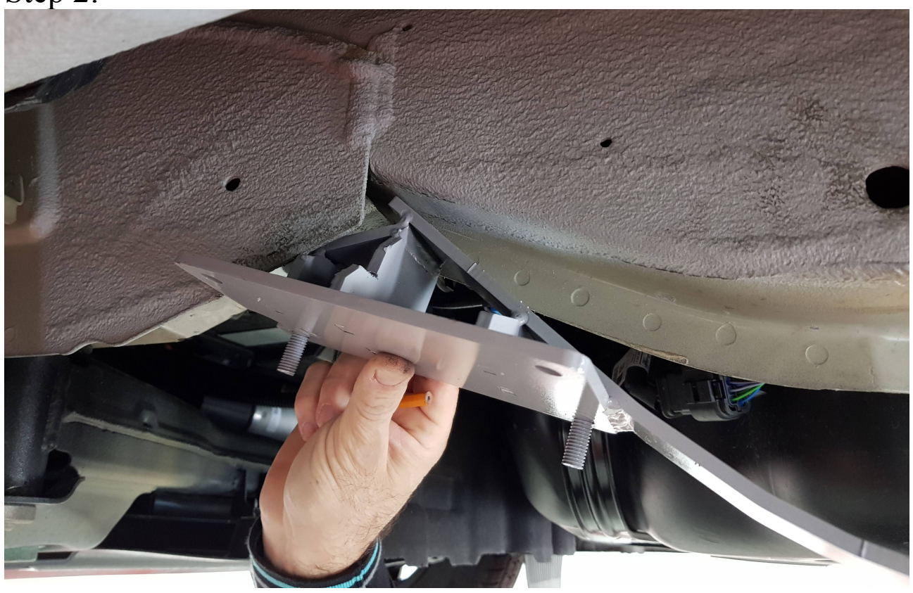
Insert the adapter in the space present on the chassis and push most frontly possible.