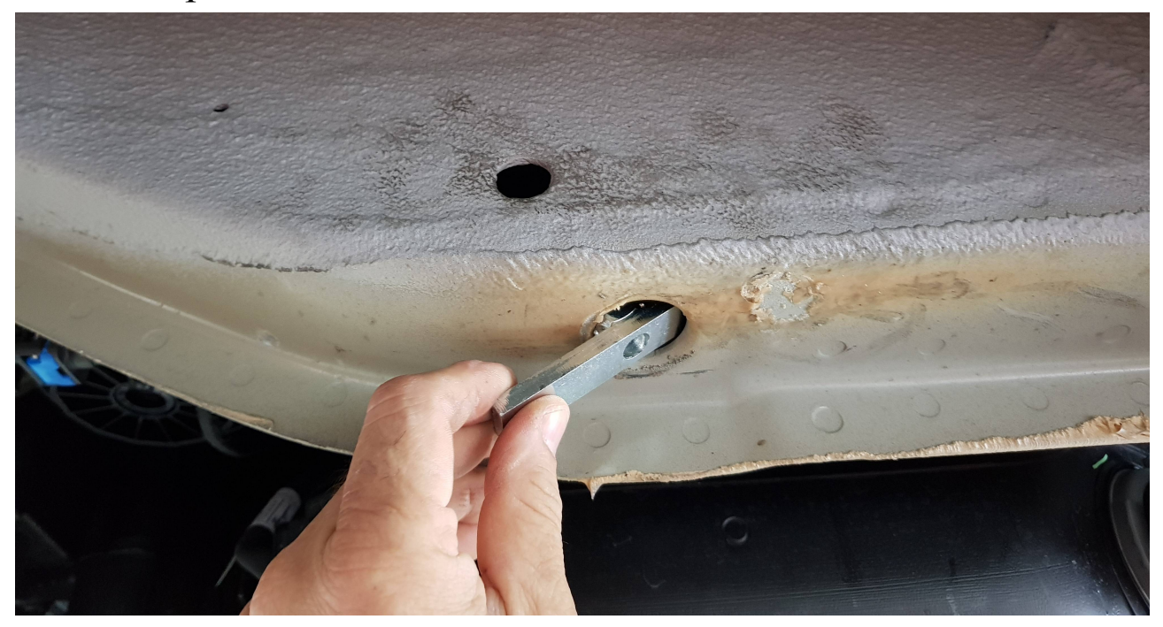
Step 1: Insert the plates in the holes